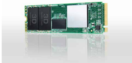
PCIe Gen3 x4 interface and NVMe standard

Transcend's MTE850 M.2 SSD utilizes the PCI Express ® Gen3 X4 interface supported by the latest NVMe™ standard, to unleash next-generation performance. The MTE850 M.2 SSD aims at high-end applications, such as digital audio/video production, gaming, and enterprise use, which require constant processing heavy workloads with no system lags or slowdowns of any kind. Powered by 3D NAND MLC flash memory, the MTE850 M.2 SSD gives you not only fast transfer speeds but unmatched reliability.